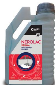
PERMA WATERPROOF POLYMER

Key products shown, for full range visit our website www.nerolacbd.com