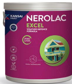
EXCEL WEATHER DEFENCE FORMULA