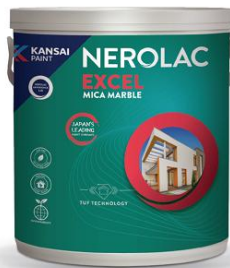
EXCEL MICA MARBLE