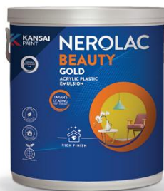
BEAUTY GOLD - ACRYLIC PLASTIC EMULSION