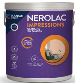
IMPRESSIONS ULTRA HD - SILK EMULSION