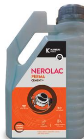
PERMA CEMENT +