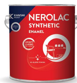
NEROLAC SYNTHETIC ENAMEL