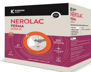
PERMA SUPER 2K