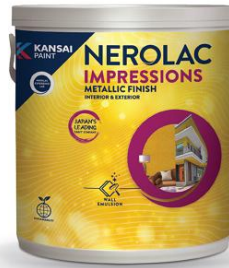
IMPRESSIONS METALLIC FINISH