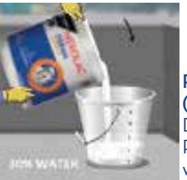
For primer coat (self priming): Dilute Nerolac Perma NoDamp with 30% water